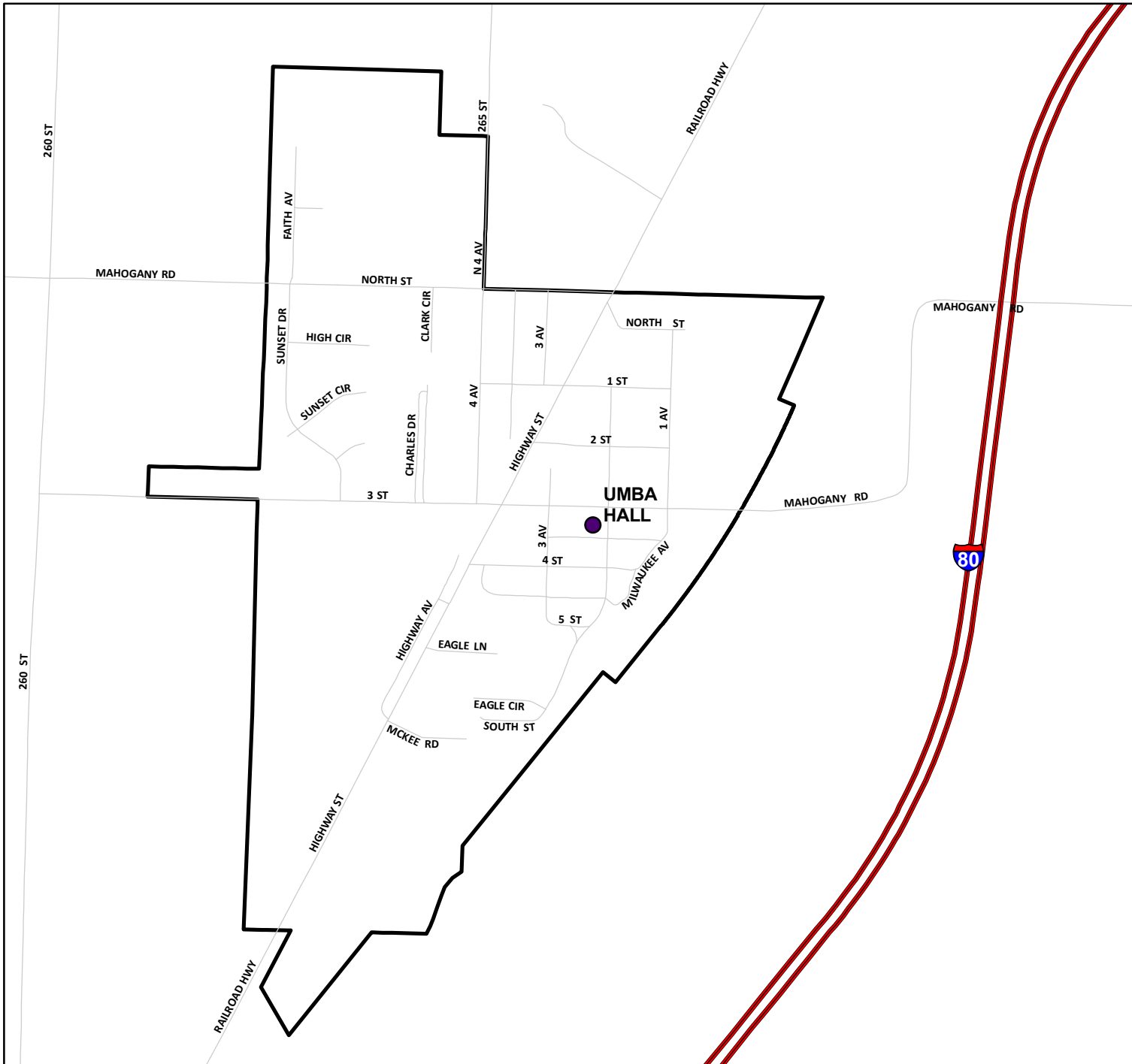
Norwalk / Hazel Dell Townships